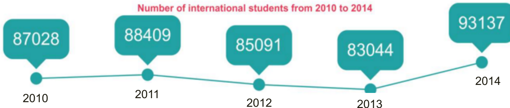
Number of international students from 2010 to 2014