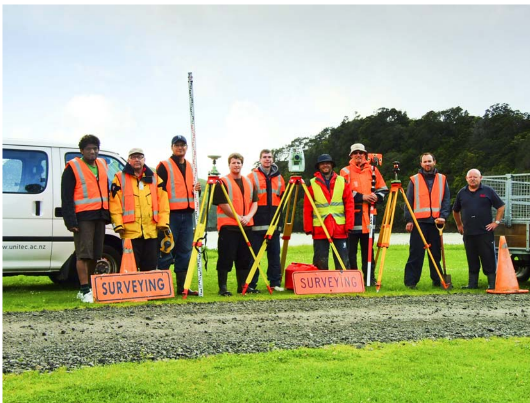
Figure 1: Unitec survey students in the field (Source: Taylor, 2009).

Unitec, along with the University of Otago are the only providers of conventional survey education in New Zealand (Figure 1). The challenge of sustainability for survey technician training in New Zealand can be found in the relationship between the profession and educational facilities (Phillips, 2000). At present, this relationship is a very healthy one with strong interaction between the New Zealand Institute of Surveyors Education Committee and the Department of Civil Engineering at Unitec. A member of the Unitec Land Surveying staff is a member and regular contributor to the committee which provides a conduit between the two parties. This factor is one of many ‘challenges’ which exist to ‘harmonize’ the different strands of – efficient delivery by the provider, needs of local employers and industry, and requirements of two sets of professional bodies.