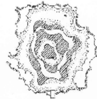
Paul Klee's The Fruit with Roberto Burle Marx's redesign of the rose gardens at Cliveden. From J. Jellicoe, The Studies of a Landscape Architect Over 80 years , 1996.

My diagrams are tools that enable landscape functions such as retaining and directing to mesh with an existing system. In the same way that, “edges are not stable, permanent borders, but change position, function and interpatch,” 45 these diagrams operate. They have the capacity to receive and process many types of information, for example form, materials and people, and the working drawings produced through their use illustrate the processing of this information.