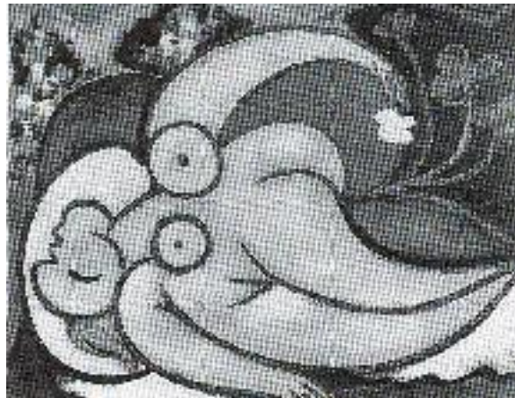
Jean-Antoine Watteau, The Intimate Toilet , c. 1715 and Pablo Picasso, Femme Couchee , 1932. From D. Hockney, That's The Way I See It , London, 1993.

Landscape architecture is well suited to contribute to this many-faceted, multidimensional discourse which is generally centred on ways of designing. Specifically because the terms self-organising, time, space, ecologies, moments, and multi-dimensionality are not only deeply embedded in its discipline, but its materials and building blocks reflect these theoretical terms. Landscape is encoded with the ephemeral, the moment, intensities and forces. Looking at landscapes from the bottom up, or upside down, enables a different viewpoint. By eluding familiar form and by viewing the landscape apart from its usual connections to objects and materiality, a new clarity becomes apparent, in much the same way as when drawing, if the